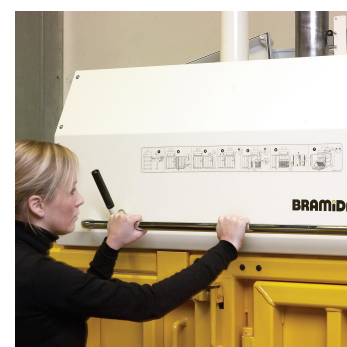
The horizontal handle gives an ergonomic working posture.